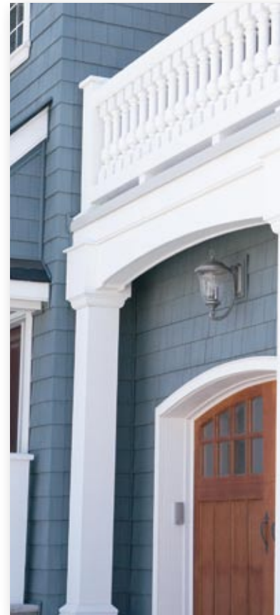
Intex column wraps are an integral part of our exterior PVC trim systems.