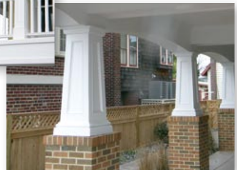
Tuscan style cap and base on tapered recessed column wrap.