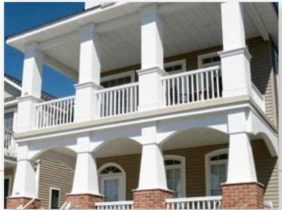
Custom column wraps are available to meet your design requirements.